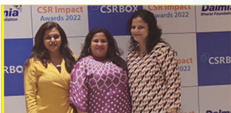
Attended the 8th 'India CSR Summit' in Delhi