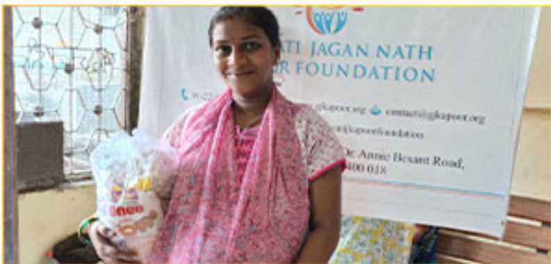
Distribution of special 'Nutrition Kits' to pregnant women from underserved areas