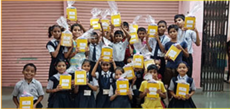
Distribution of 1000 stationary kits to students from the community