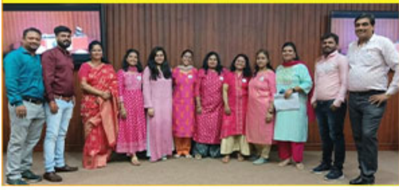
Celebration of first 'Breast Cancer Awareness Month with ACTREC - Kharghar'